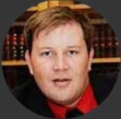
PETRUS JACOBUS JOUBERT